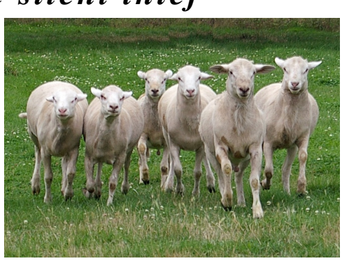
OPP . . . the silent thief