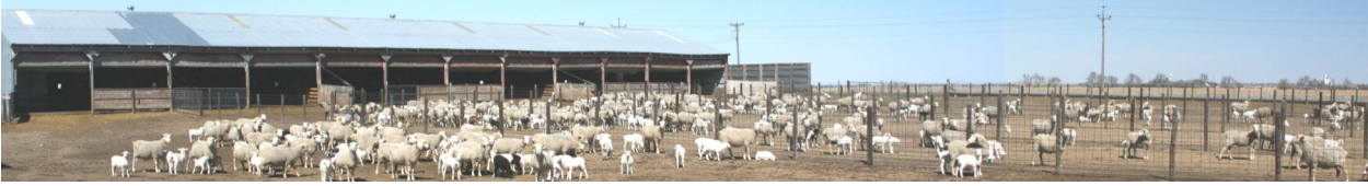
USMARC ewes and lambs with different TMEM154 genotypes under conditions of a natural OPPV challenge.

significant OPPV exposure. Because the scientific and production information on 4,4 knockouts are very limited, additional research is needed to determine the effects of haplotype 4 before any recommendations can be made to use this haplotype to lower OPPV infection. Currently, the effects of TMEM154 variants on OPPV infection rates are being studied at USMARC under conditions of natural challenge to provide selection guidelines for industry use.