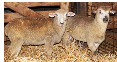
TMEM154 “4,4 knockouts” at USMARC

We also observed six additional TMEM154 haplotypes that occur at low frequencies, yet may also confer low susceptibility like haplotype 1. For example, it appears that haplotype 4 encodes a non-functional protein and may confer OPPV resistance. Although rare, sheep with two copies of haplotype 4 (referred to as “4,4 knockouts”) have remained uninfected despite a lifetime of